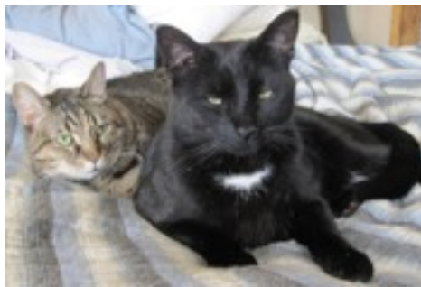
Pasha in her new home with her boyfriend Craisin