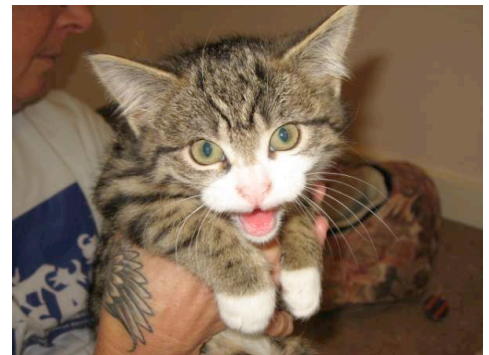
Rocky Road on his first day. Now very lovable

All of our adoptable cats and dogs are listed on Petfinder.com under "Shelter 02657"